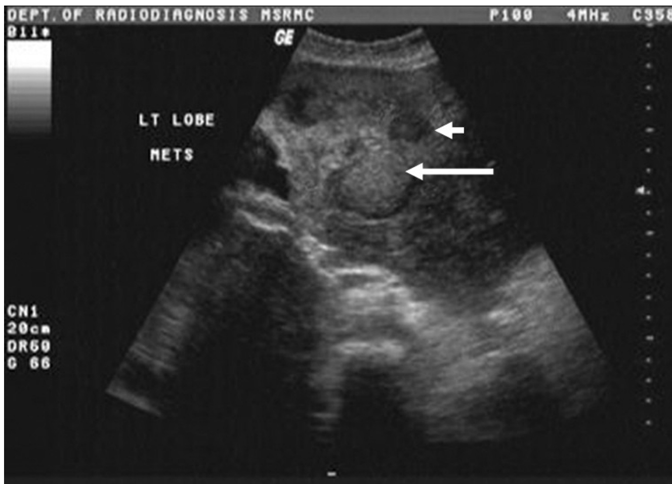
Figure 2 Abdominal ultrasound showing multiple hypoechoic (short arrow) and hyperechoic lesions (long arrow) in the liver

reported to be less than 50% for all grades [9,10]. These carcinomas typically show frequent recurrences and late distant metastases [11]. In a retrospective review of 92 cases, a tumor size greater than 4 cm was associated with an unfavorable clinical course [12]. Cribriform and solid patterns seen histologically were thought to predict more biological aggressiveness while tubular pattern represented more differentiated pattern of ACC. Over long periods of patient follow-up such grade based prognostication is less valid. Currently, stage and tumor location are the only factors considered prognostically significant [13].