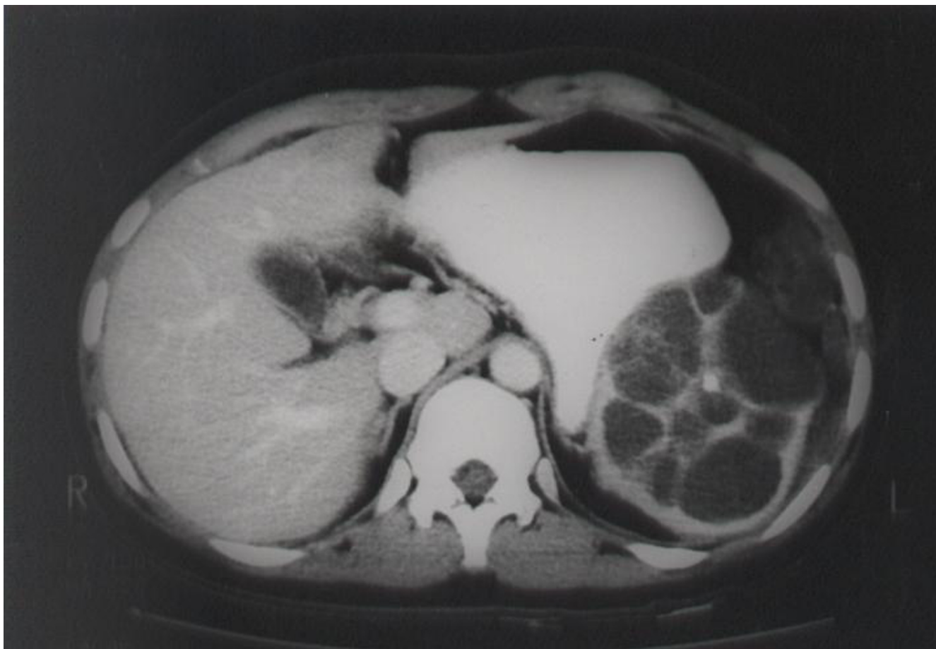
Figure 1 Abdomen CT shows 9 × 8 cm-sized multiseptated cystic lesion with inner calcification in the spleen.

splenic lesion, which had been existed for 2 years, was merely noticed as simple cystic lesion unrelated to the ovarian mass.